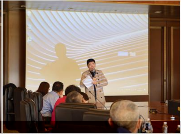
2014 APEC 2017